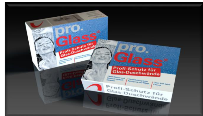
pro.Glass® Shower with Logo