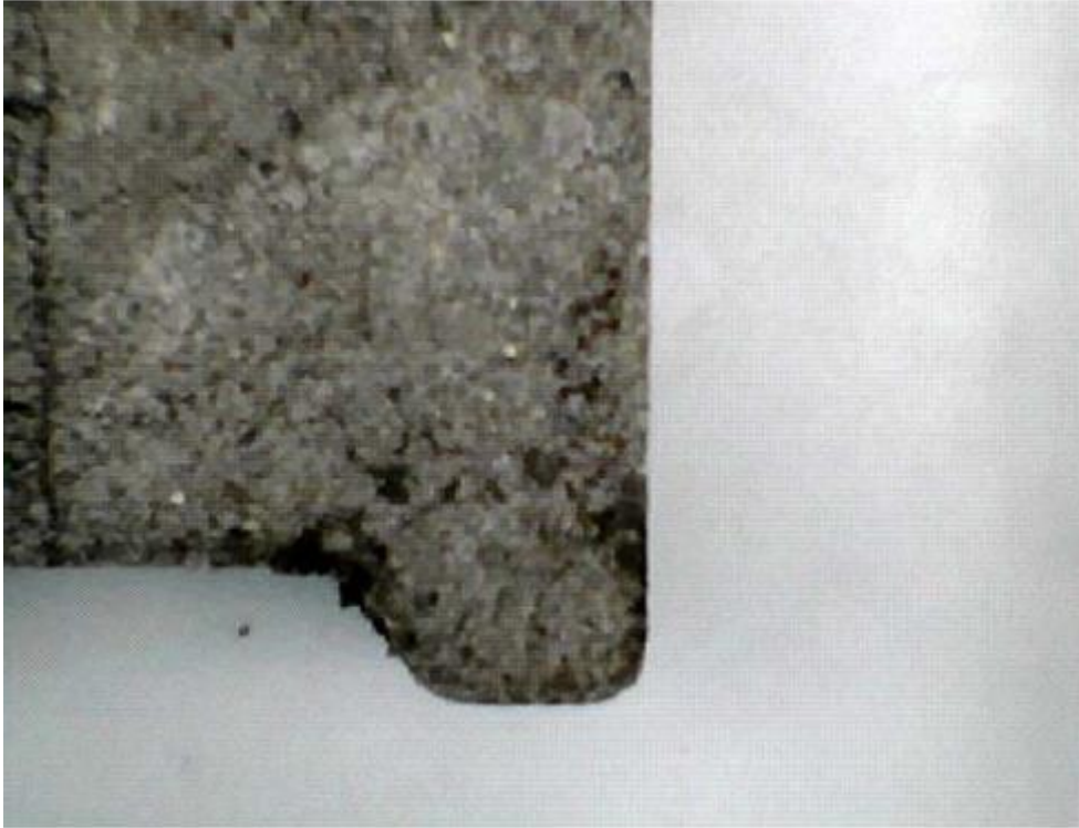
Figure :2 Paving stone coated with Gum Magic