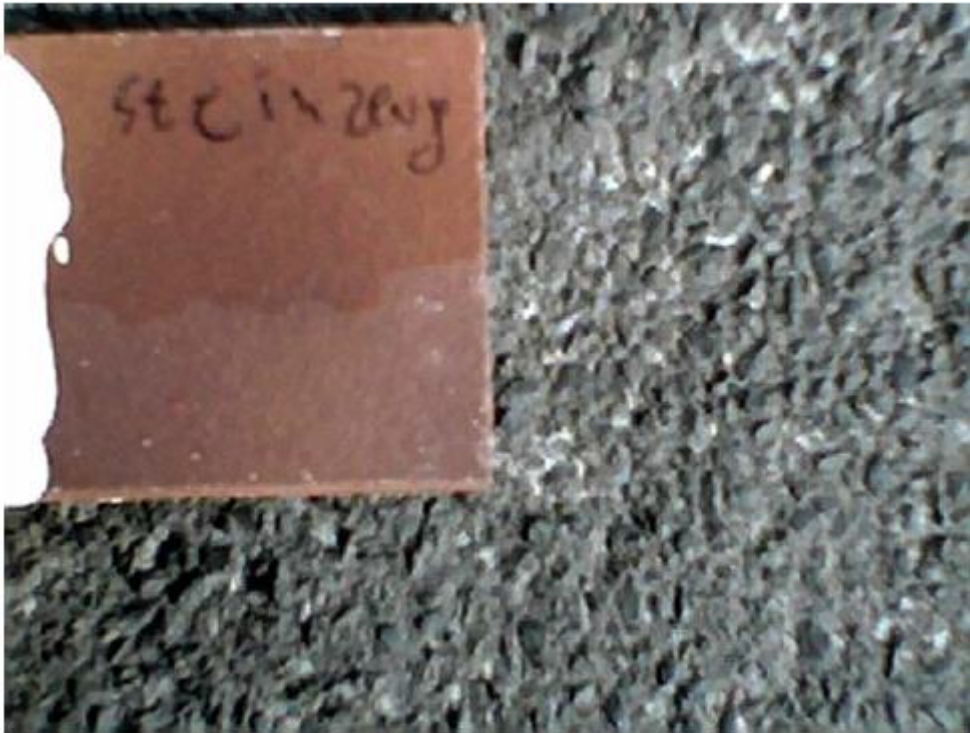
Figure :1 Stoneware coated with Gum Magic

Following package instructions, tiles, stoneware, brick and paving materials from pedestrian areas have been coated with “Gum Magic - Chewing Gum Protection” The result of the tests are shown in the pictures below: