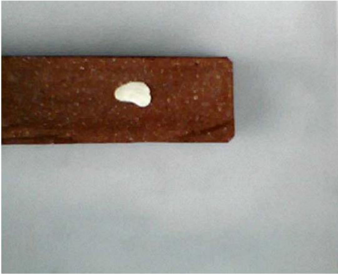
Figure: 6 Chewing gum on coated paving stone

The coated tiles respectively paving stones loaded with chewing gum were exposed to weather conditions for 6 weeks. It was noted that the coated surfaces did not undergo any change during this time, and the chewing gum was subject to aging processes during the alternating sunshine and rain. Localized flatting could not be noticed.