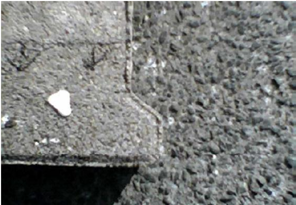
Figure: 5 Chewing gum on coated paving stone