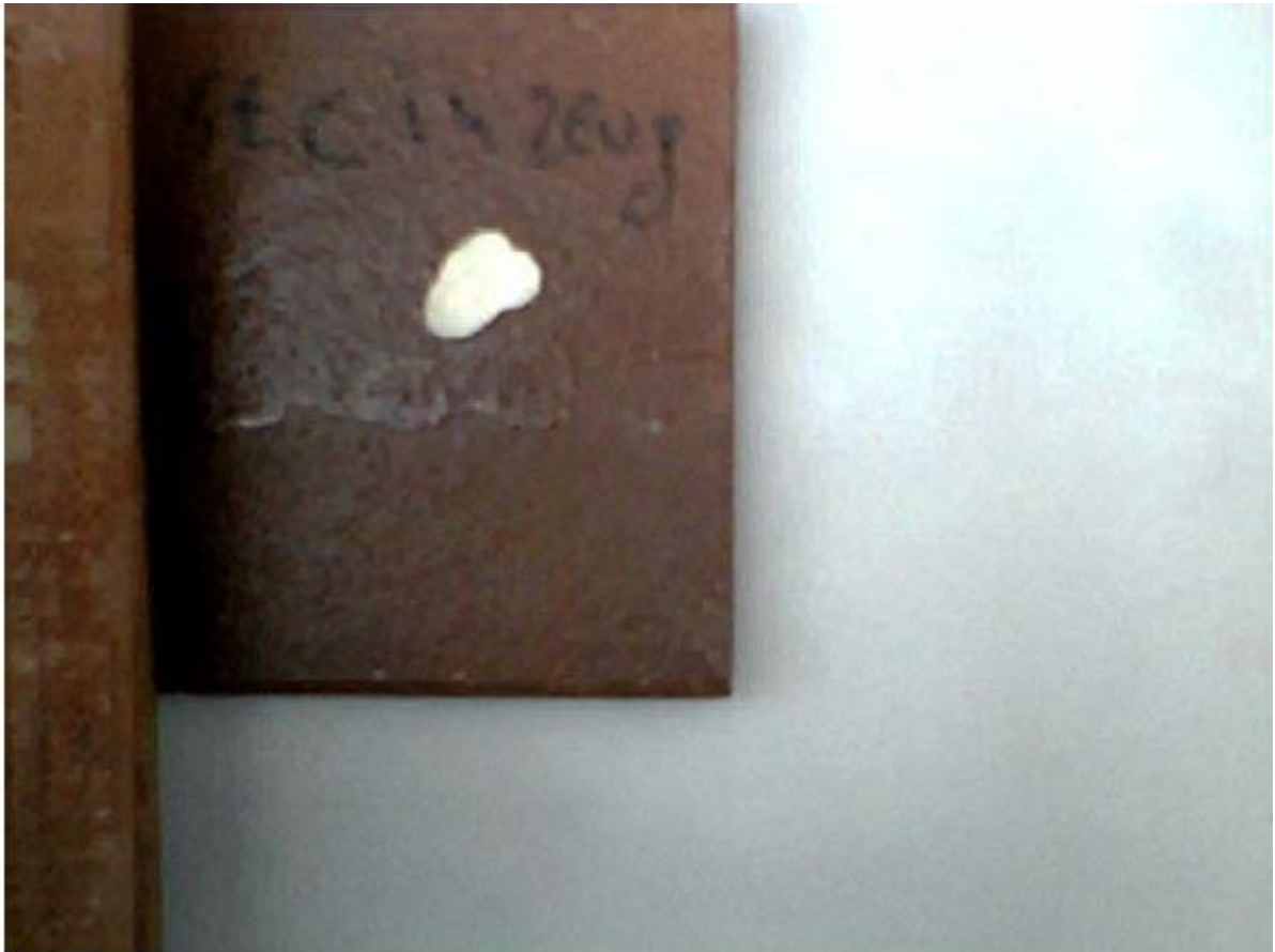
Figure: 4 Chewing gum on coated stoneware